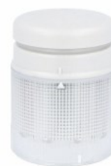
Signal tower Ø70mm/2.75" 8TL7