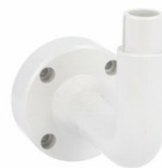
Fixing bases for signal tower and beacons - Vertical wall mount 8LT7BP02G