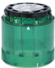
Signal tower Ø70mm/2.75" 8TL7EL - Light modules