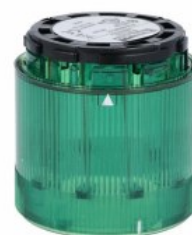
Signal tower Ø70mm/2.75" 8TL7FL - Light modules