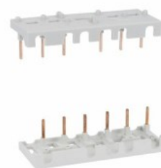
3P Rigid connecting kits for BF26...BF38 BFX3201