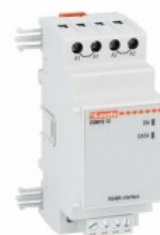
Expansion modules for modular products - communication port EXM1012