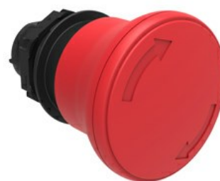
Mushroom head pushbutton, Latch, turn to release Ø 40mm/1.6" LPCB634