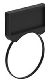
Label holder for engraved plastic LPX AU109 label LPXAU100