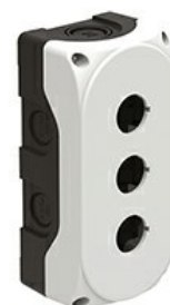
Plastic control station without actuators - for 3 actuators LPZP3A8