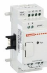
Micro PLC expansion module, 4 digital inputs + 4 relay outputs LRE08RA024