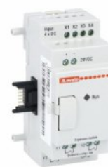
Micro PLC expansion module, 4 digital inputs + 4 relay outputs LRE08RD024