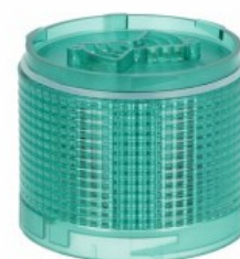
Signal tower Ø70mm/2.75" LTN70