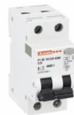
Residual current circuit breakers (RCCB) with overcurrent protection P1RE 1P+N 2 IEC