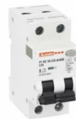
Residual current circuit breakers (RCCB) with overcurrent protection P1RE 1P+N 2 IEC