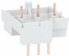
Rigid SM1 breaker-contactor connections SM1X Rigid SM1P breaker - BG contactor connections. SM1P...