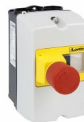
Surface mount enclosures IP65 (4X) for SM1P SM1Z Surface mount enclosures IP65 (4X) for SM1P SM1P...