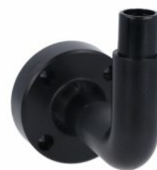
Fixing bases for signal tower and beacons - Vertical wall mount 8LT7BP02