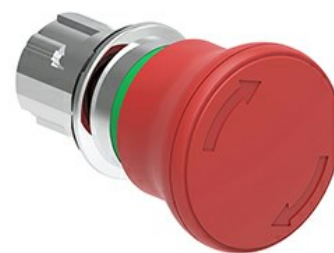
Mushroom head pushbutton, Latch, turn to release Ø 40mm/1.6" LPSB664