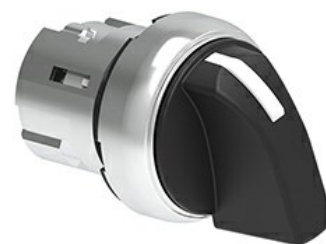
Selector switch actuators lever - 2 position LPSS12