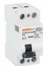
Residual current circuit breakers (RCCB) P1RD 2P 2 IEC