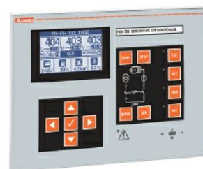
Automatic mains failure gen-set controllers RGK700