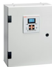
Enclosed automatic transfer switches ATS ATP