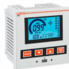
Automatic power factor controller, 3 steps, icon display DCRL3