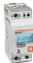
Single-phase energy meters DMED115T1 single-phase 2