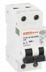
Residual current circuit breakers (RCCB) with overcurrent protection P1RE 1P+N 2 IEC