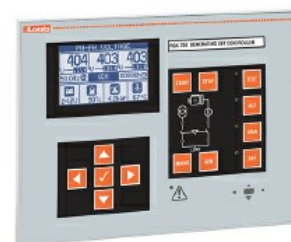
Automatic mains failure gen-set controllers RGK700