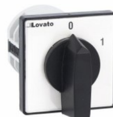
Rotary cam switches 7GN20