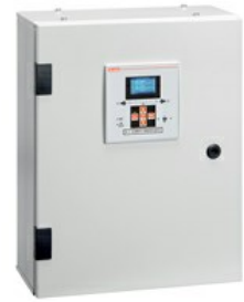
Enclosed automatic transfer switches ATS ATP