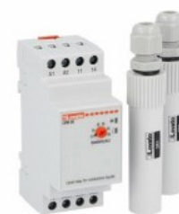
Level control relay for emptying function. Single voltage. Modular version - KIT LVMKIT20 Emptying