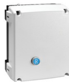
Empty enclosures M3RA