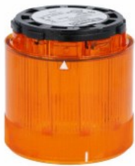
Signal tower Ø70mm/2.75" 8LT7EL - Light modules