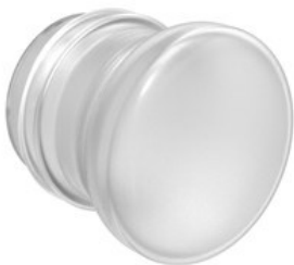
Rubber boot for mushroom head buttons, LPC B63/B66/B67/ BL66... transparent LPXAU167