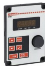
Door-mount keypad for VT1 drives VT1XC02